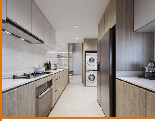
4 - Bedroom Premium